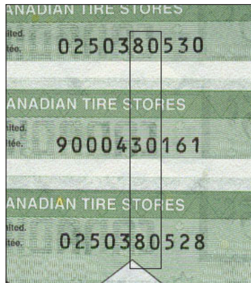
Top note - CTC S27-B05 Center - CTC S27-Ba05 Bottom - CTC S27-B05