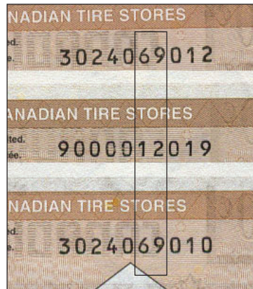
Top note - CTC S27-E06 Center - CTC S27-Ea03 Bottom - CTC S27-E06