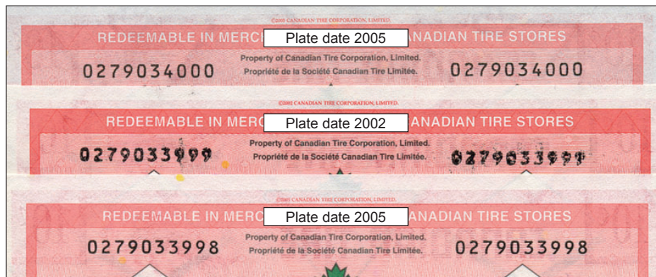
Note 0279033999 is a hand numbered same number replacement.