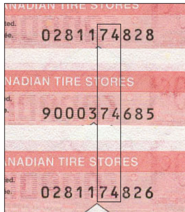
Top note - CTC S27-C05 Center - CTC S27-Ca04 Bottom - CTC S27-C05