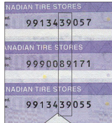
Top note - CTC S27-D06 Center - CTC S27-Da04 Bottom - CTC S27-D06