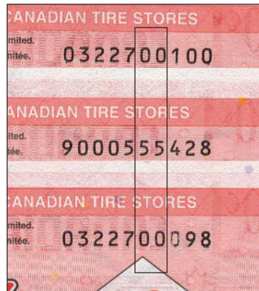
Top note - CTC S29-C07 Center - CTC S28-Ca06 Bottom - CTC S29-C07