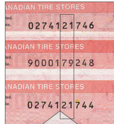
Top note - CTC S27-C05 Center - CTC S27-Ca02 Bottom - CTC S27-C05